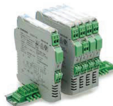
Dimensions: 118.9mm × 106.0mm × 12.5mm